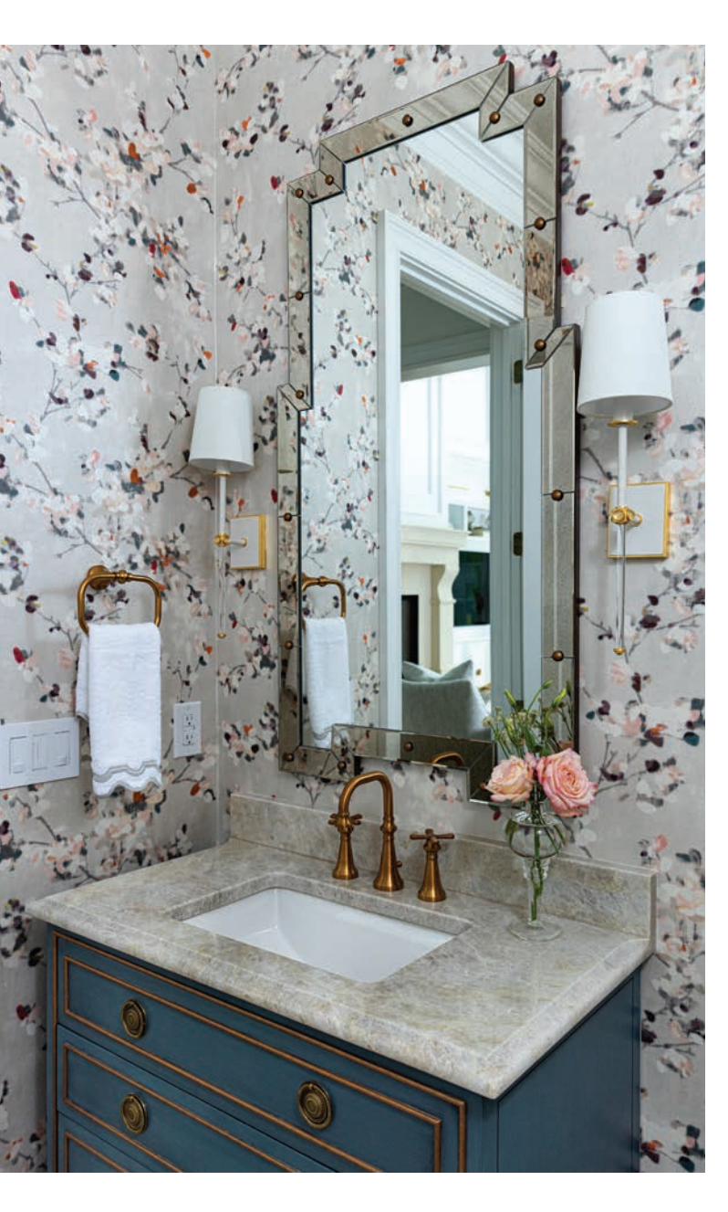
ABOVE: The jewel box of a powder room features Romo wallpaper and a custom vanity by Old Biscayne Designs, designed by McKay. The sconces are by Visual Comfort. A mirror by Bungalow 5 keeps things interesting.

RIGHT: In the pool house bathroom, McKay chose an apropos wallcovering with a mermaid pattern by Hygge & West in cool blues, and paired it with crisp black marble and white tile from Traditions in Tile and Stone.