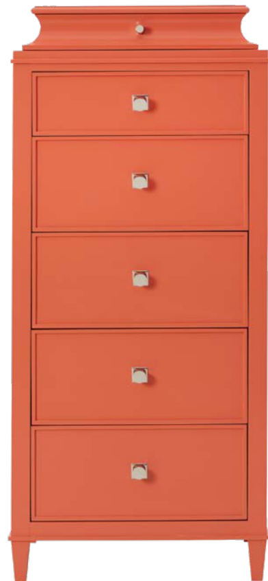
CLOCKWISE FROM TOP RIGHT: COURTESY OF POPUS EDITIONS; COURTESY OF OOMPH; COURTESY OF STUDIO ROOF.