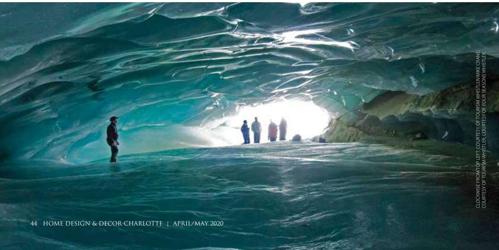
CLOCKWISE FROM TOP LEFT: COURTESY OF TOURISM WHISTLER/MIKE CRANE; COURTESY OF TOURISM WHISTLER; COURTESY OF FOUR SEASONS WHISTLER