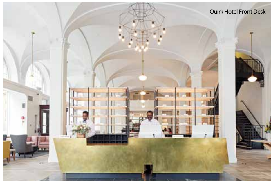
Quirk Hotel Front Desk

In the last decade, Richmond has undergone an art renaissance, blending modern architectural designs and street art with its rich Southern aesthetic. Currently, Richmond boasts more than one-hundred murals by local and international artists—a “living canvas” that’s emblematic of the city’s thriving, contemporary cultural scene.