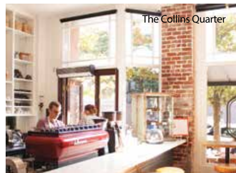
The Collins Quarter