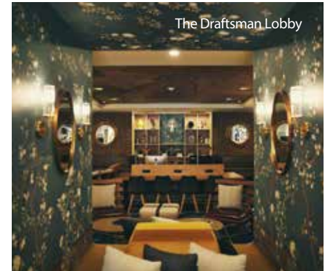
The Draftsman Lobby