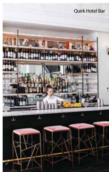
Quirk Hotel Bar