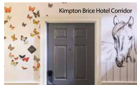
Kimpton Brice Hotel Corridor