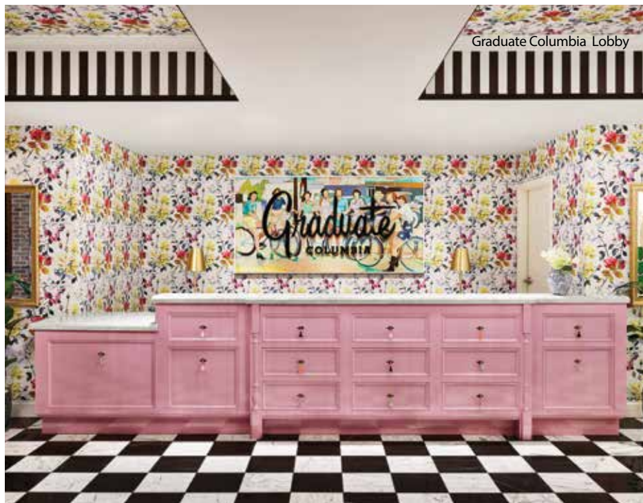
Graduate Columbia Lobby

A true Southern city, Columbia, South Carolina, may be best known as the state capital and home to the University of South Carolina. But over the last decade, the city has undergone a major resurgence with revitalized neighborhoods, trendy festivals, and new restaurants, turning this college town into a burgeoning metropolis.