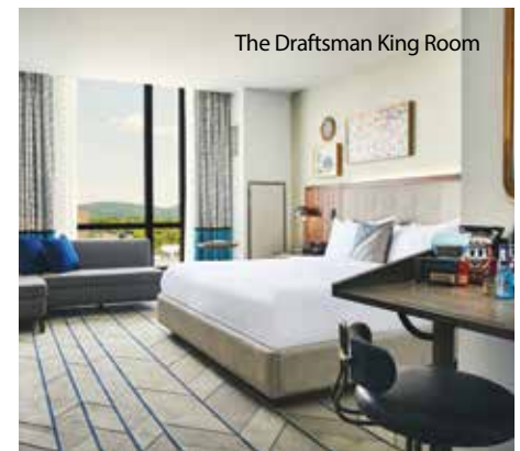
The Draftsman King Room

Artisan Gallery featuring beautifully curated works such as pottery, carved wood, and hand-crafted silver.