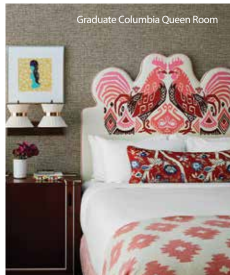
Graduate Columbia Queen Room

it opened in 1976 and is chock full of an eclectic mix of everything from wall art to ergonomically designed lounge chairs. Just a few steps away is Just the Thing , which features clothing, shoes, and handbags, as well as jewelry and gifts. There's also Pink Sorbet for the Lilly Pulitzer fan and Half-Moon Outfitters for the outdoorsy type.