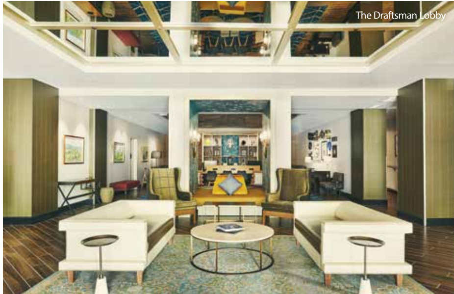
The Draftsman Lobby

There are certain stops in Charlottesville that are musts for any first-time visitors. Visiting Thomas Jefferson's fascinating Monticello home. Lunching at the nearby circa-1784 Michie Tavern. Perusing the University of Virginia's bustling campus. But these things have all been a part of this vibrant city for decades—or even centuries. Today, its chef-driven restaurants, gorgeous vineyards, and charming shops are drawing fresh attention. And there's no better time for a getaway to the new Charlottesville.