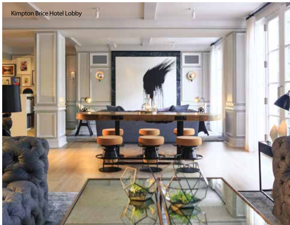
Kimpton Brice Hotel Lobby

Around every charming corner in Savannah, you'll encounter the striking balance between the old and the new: cutting-edge art and design influence from students at the Savannah College of Art and Design (SCAD) against the dramatic backdrops of Victorian Regency, Greek and Gothic Revival, and Italianate architecture.