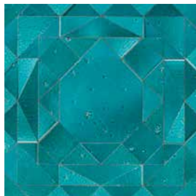
New Ravenna Bismark Grand Bright Young Things Collection newravenna.com

Hand-drawn curves and undefined shapes are the hallmarks of the Mochi Collection by Commune. The freestyle nature of the tiles defies conventional tile design by allowing the customer to be the designer, creating something fluid, one-of-a-kind, and personal. The results exude a contemporary and ethereal quality that brings about unlimited options. The magic happens with the tiles repeat in an out-of-the-ordinary fashion, creating unexpected relationships. Available in two colorways, pink and indigo, the resulting wow-factor can be seen even before installation. xsurfaces.com