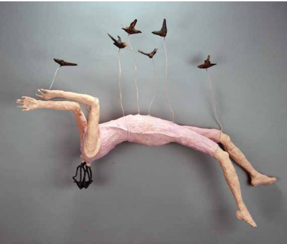
Johan Hagaman "Fear of Landing" Concrete, wood, and milk paint 15 x 20 x 4 inches

This time of year is perfect for a gallery crawl – a new piece of art can really up the ante when it comes to your decor. And it's something you can do no matter what unpredictable weather Mother Nature decides to unleash. Here's a look at what's to come from five of Charlotte's best.