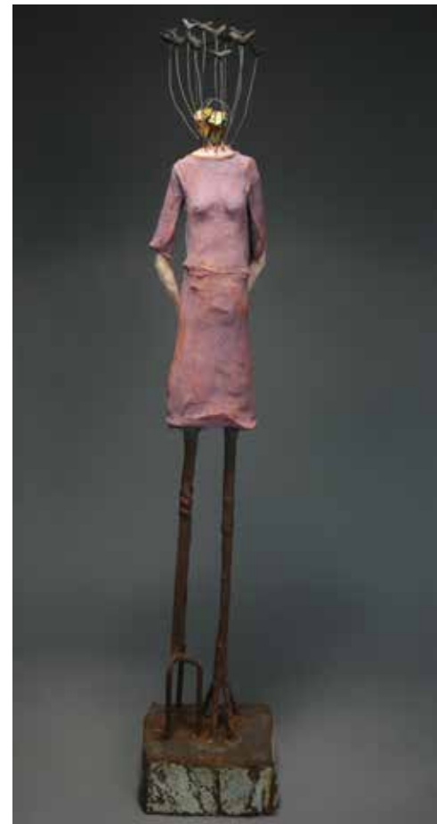
Johan Hagaman "Flight Inside" Concrete, found objects, and milk paint 37 x 6 x 6 inches