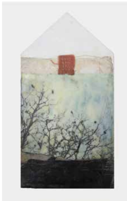
Bridgette Guerzon, "Rise Again" and "The Shelter of Each Other" Encaustic mixed media 5 1/2 x 11 inches