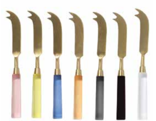
"These colorful cheese knives are perfect for entertaining and are a great price! Wrap with a jar of truffle honey for the ultimate hostess gift." Kip & Co musk cheese knife, $19 each, www.kipandco.com