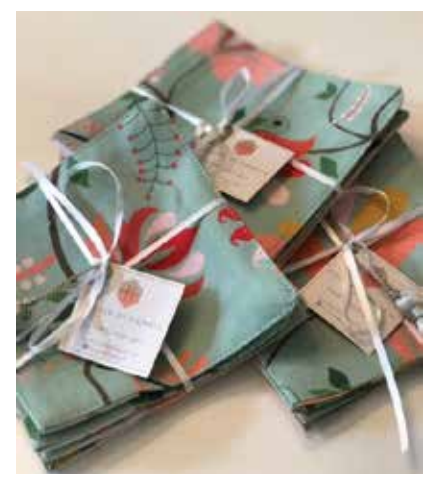
"These whimsical coasters make great hostess gifts and pack a punch of color to any holiday party." House of Harris cocktail coasters, $35 for a set of four, www.houseofharris.com