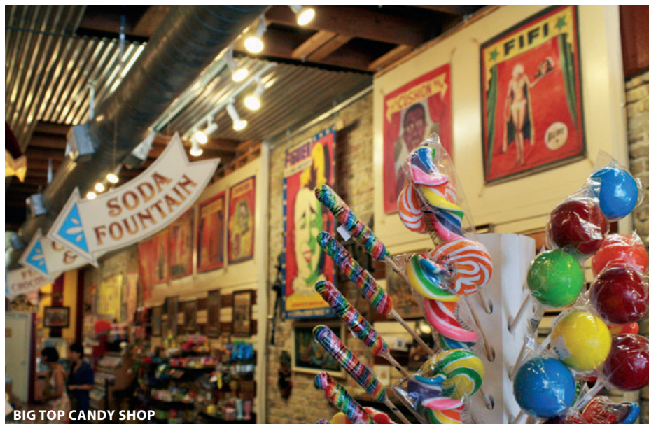
BIG TOP CANDY SHOP

Texas is filled to overflowing with candy stores, candy companies, candy to buy for yourself and candy to mail to lucky others as the gifting season approaches. After studying, researching, sampling and savoring, we have come to one conclusion: Candy is good. Thinking about it, eating it, thinking about eating it — it's the best. Check out these selected sweet shops, and feel like a kid in a candy store again.