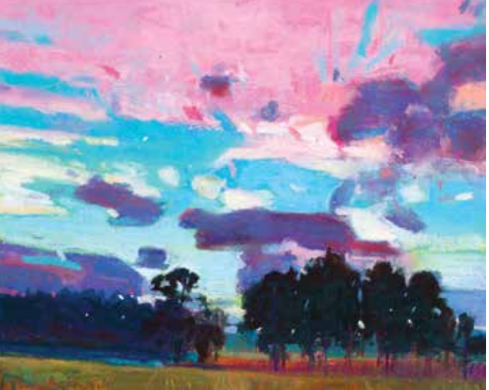
Charles Basham HIGH MAGENTA 2014 Pastel on Paper 11 x 13 1/2 inches